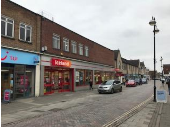
Front of the property from the High Street